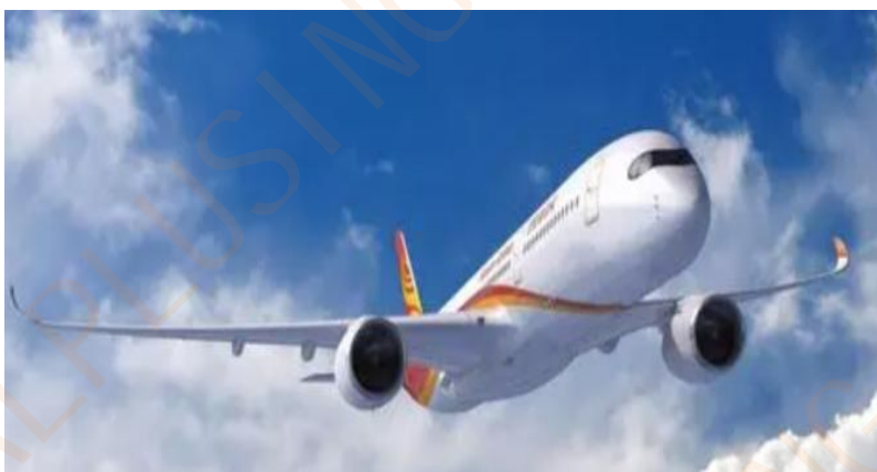
Air transport (No magnet/Lithium free battery)